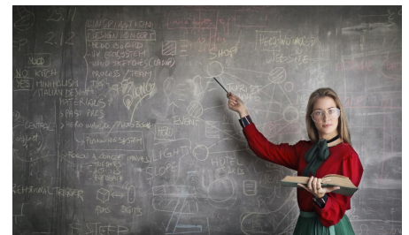
INTRODUCTION TO THE