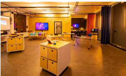
FABLAB EN I-LAB